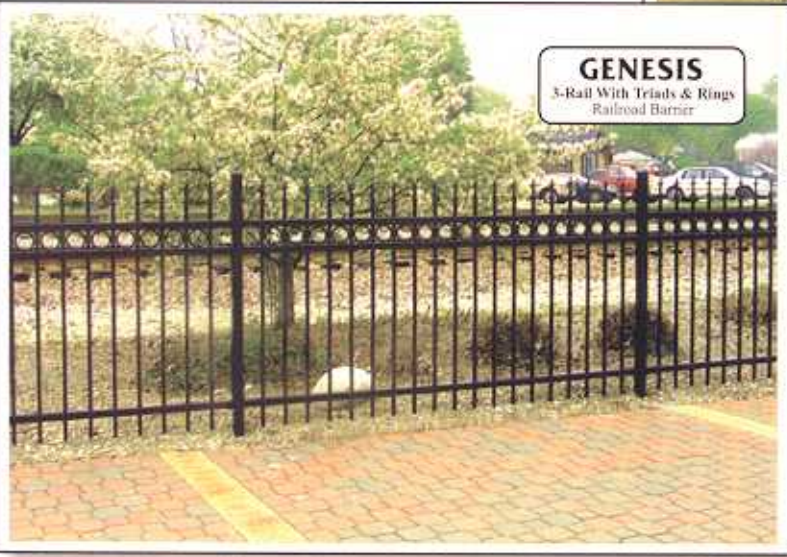
GENESIS 3-Rail With Triads & Rings Railroad Barrier

The addition of a row of rings between the top two rails is a wise choice in two ways: it enhances the decorative look while it nearly doubles the strength of the fence.