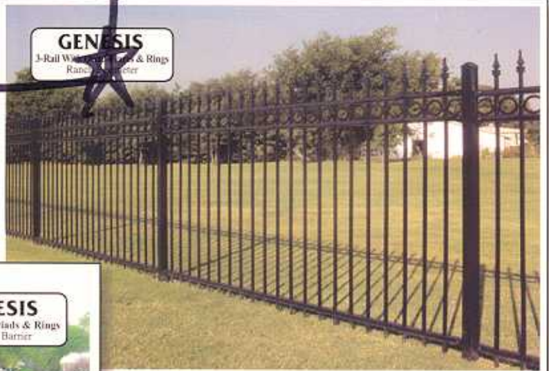
GENESIS 3-Rail With Rings & Rings Ranch Perimeter

The Genesis style carries an inherent beauty that adds a decorative touch to any residential landscape, whether an individual home, a gated community, or a series of multi-family dwellings.