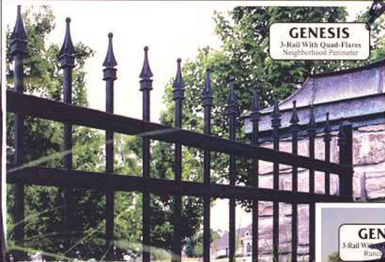
GENESIS 3-Rail With Quad-Flares Neighborhood Perimeter

The Genesis style carries an inherent beauty that adds a decorative touch to any residential landscape, whether an individual home, a gated community, or a series of multi-family dwellings.