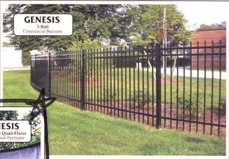
GENESIS 3-Rail Commercial Business