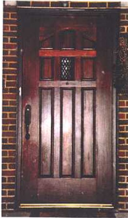
Above: Photo from Tudor-style home at 4760 Washington Blvd.

Door Hardware: San Carlos Steel Ornate Handle Passage Door Set