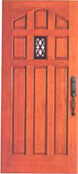
Above: Manufacturer's photo